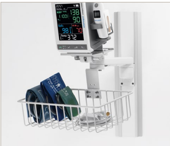
Wall mount with basket

The SC300’s flexibility is enhanced through a choice of mounting options, users can select either a mobile stand with integrated accessory storage, a wall mount option also with a storage capability or an IV pole attachment where space may be limited.