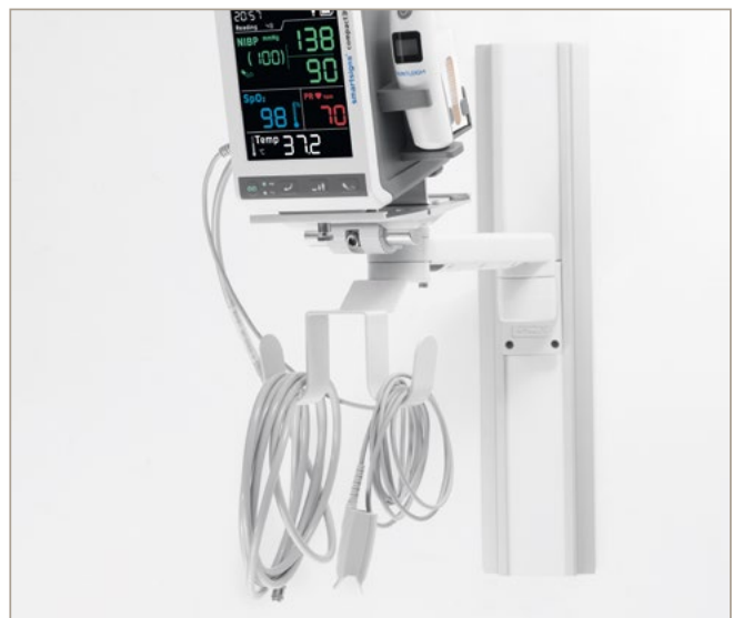
Wall mount with utility hook